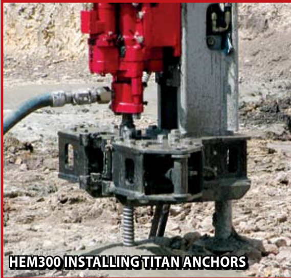
HEM300 INSTALLING TITAN ANCHORS