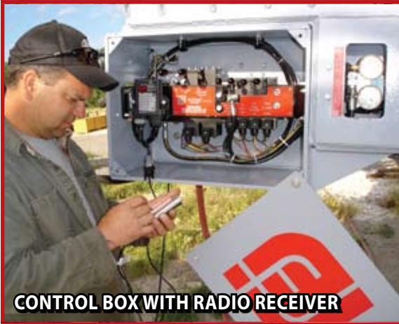
CONTROL BOX WITH RADIO RECEIVER